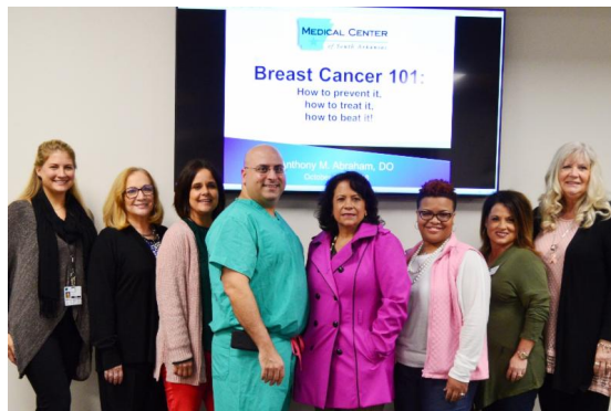
Breast Cancer 101 hosted by Healthy Woman Board and South Arkansas Surgical Specialists