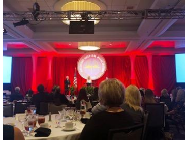
AHA Awards Presentation